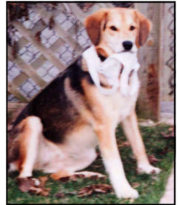
Heather & Bob's Phoebe & the run away brassier!