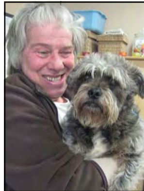
Faye & Hercules